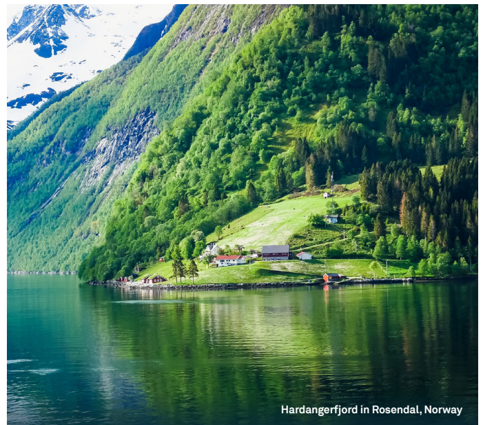
Hardangerfjord in Rosendal, Norway

Arrive this morning in Norway's second largest city, the Hanseatic fishing port of Bergen, which dates back to the 12th century. Surrounded by seven hills, it's considered one of the prettiest cities in Norway