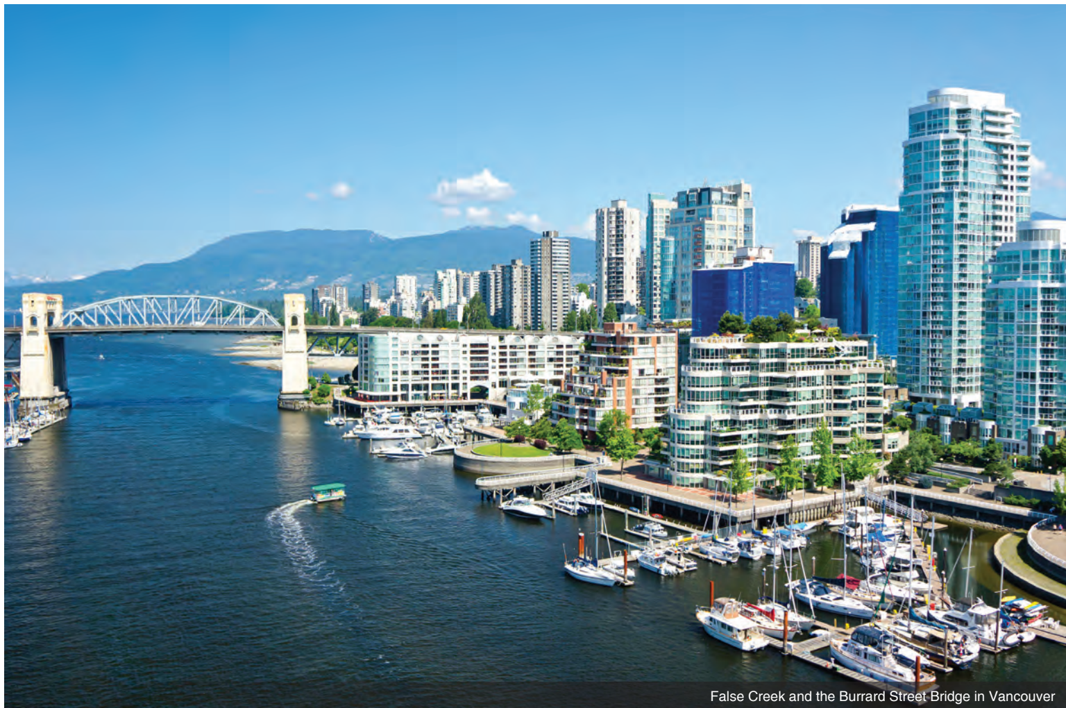
False Creek and the Burrard Street Bridge in Vancouver