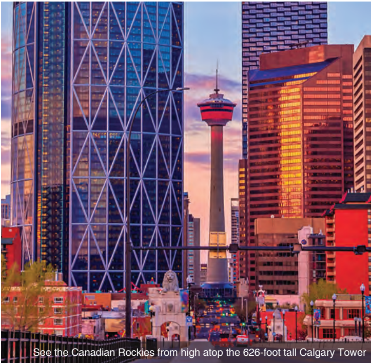
See the Canadian Rockies from high atop the 626-foot tall Calgary Tower