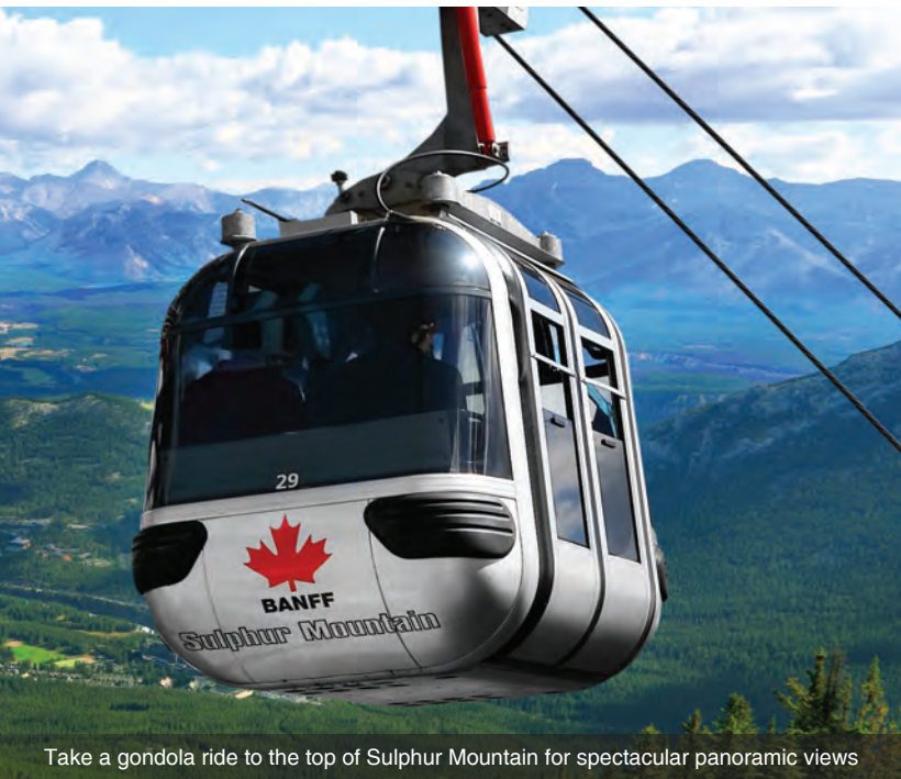
Take a gondola ride to the top of Sulphur Mountain for spectacular panoramic views

DAY 7 Museum of Anthropology, Granville Island and Gulf of Georgia Cannery: Begin the day at the Museum of Anthropology renowned for its world arts and cultures and works by the First Nation bands. Spend time at Granville Island's public market, the crown jewel of the island. This outdoor market features colourful food, produce stores, handcrafted products and unique gifts. Later visit the Gulf of Georgia Cannery. Built in 1894 this National Historic Site echoes the days of when British Columbia was a leading salmon producer. Meals: B, D