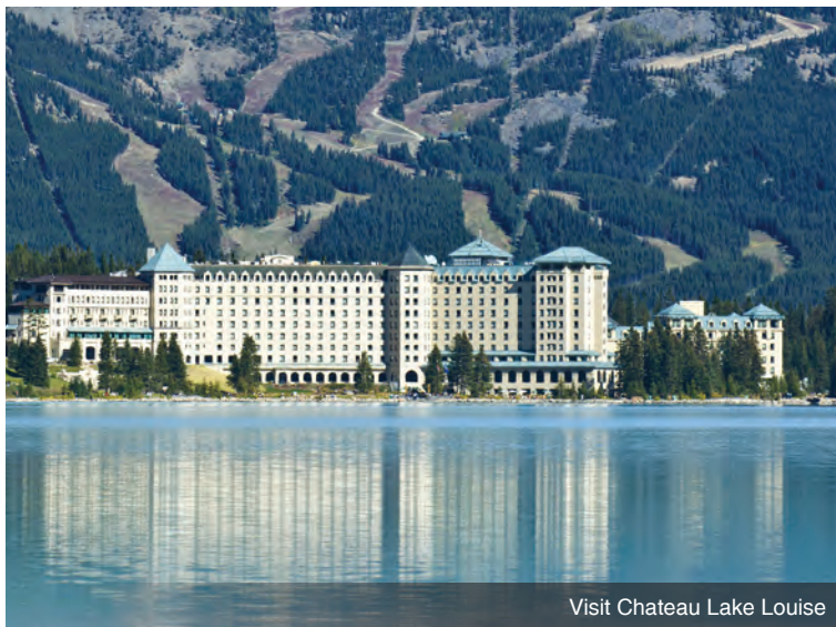
Visit Chateau Lake Louise

DAY 8 Return Home: Following breakfast, depart with a group transfer to the Vancouver International Airport for flights out after 11:00 a.m. Meal: B