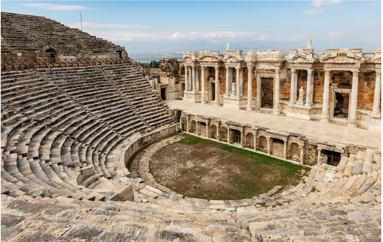
Visit the ancient city of Hierapolis – a UNESCO World Heritage Site