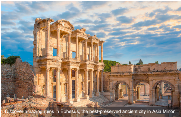
Discover amazing ruins in Ephesus, the best-preserved ancient city in Asia Minor

DAY 9 Pamukkale – Kusadasi: After breakfast, you will depart for Kusadasi. Explore the timeless city of Ephesus where history and archaeology will offer you their majesty with incredible richness. Ephesus was the Capital of the Province of Asia Minor famed for its flavorsome market during the Roman Era. You will pursue the traces of the glorious past of Ephesus walking on the Marble Road that runs through the city. You will get to see Temple of Hadrian, Library of Celsus and the Great Theater of Ephesus. Return to your hotel in Kusadasi for dinner and overnight stay. Meals: B, D