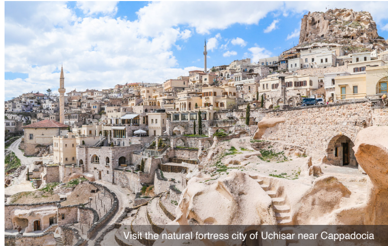
Visit the natural fortress city of Uchisar near Cappadocia

DAY 1 Depart the USA: Depart the USA on your overnight flight to Istanbul, Turkey.